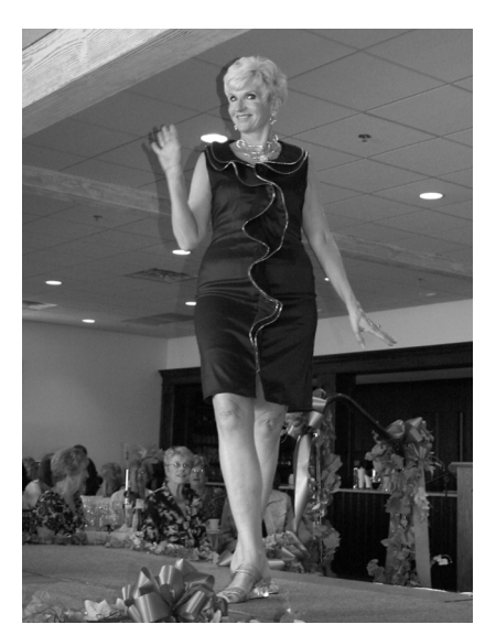
Fashions (and models) provided by The Country Ewe.